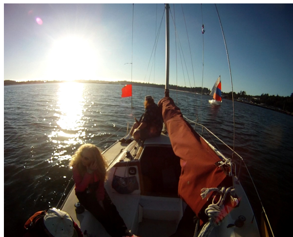
Grinner-cam at sunset