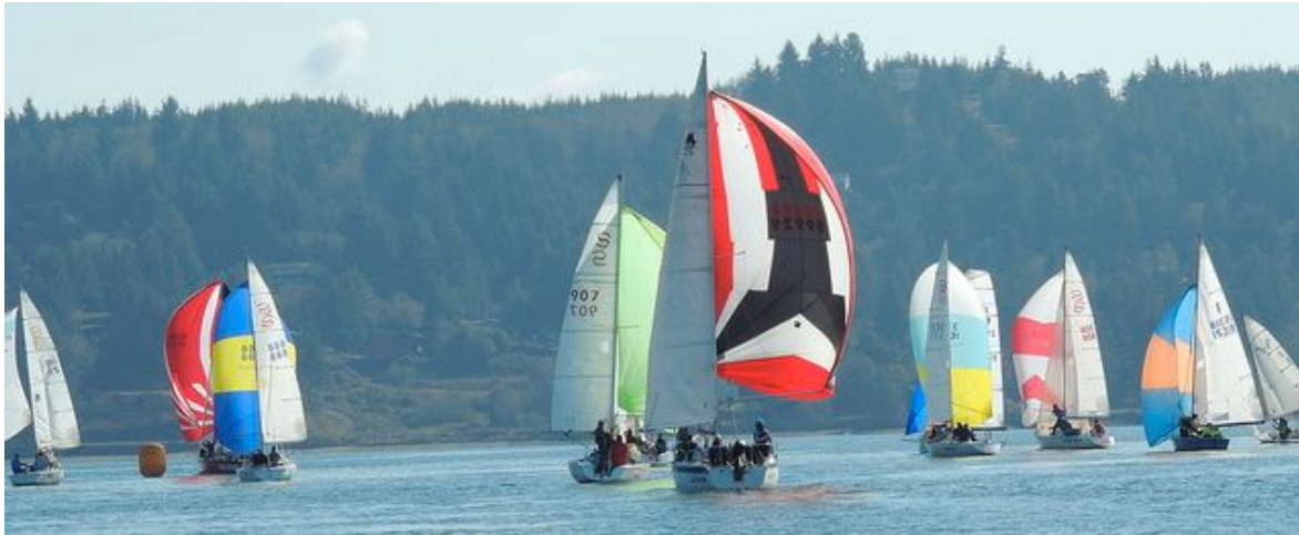
2013 YBYC Columbus Day Hospice Regatta

A publication for the Members and Friends of the Yaquina Bay Yacht Club-est. 1947