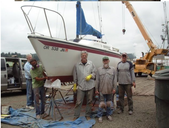
YBYC's Spirit gets spruced up