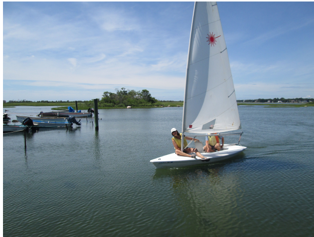
Sailing on Quonnie Pond