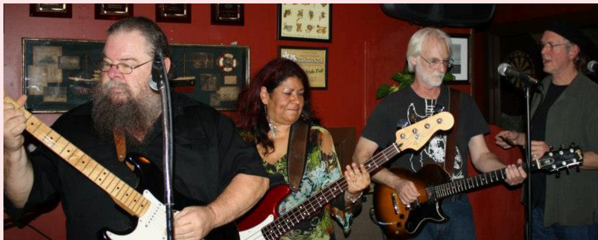
High Fidelity Blues Band

Suggested donation to this FUN event is $5 per adult.