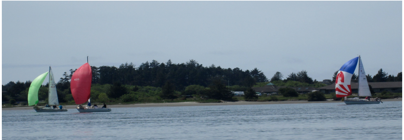
Spring Regatta 2013

A publication for the Members and Friends of the Yaquina Bay Yacht Club-est. 1947