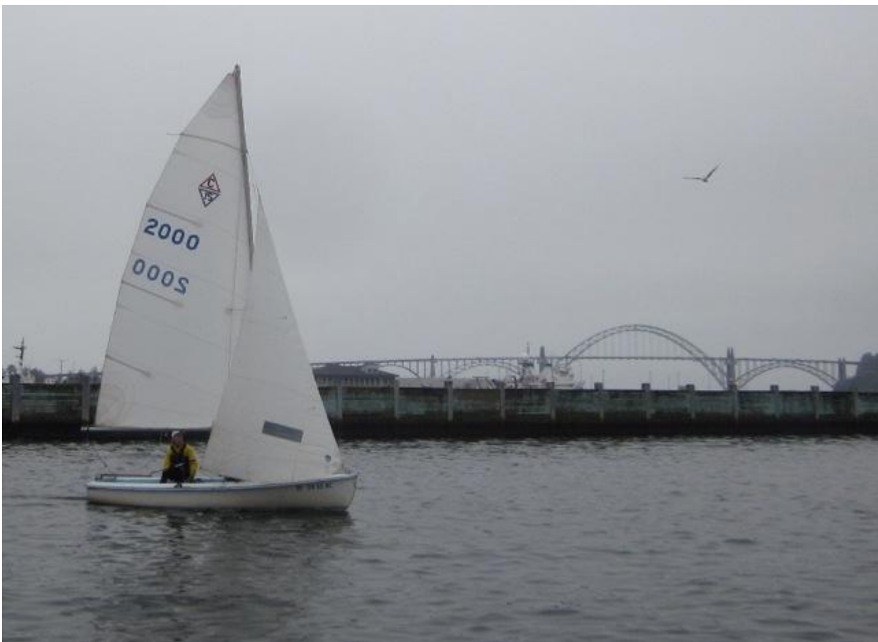
A great shot of the C-15 regatta