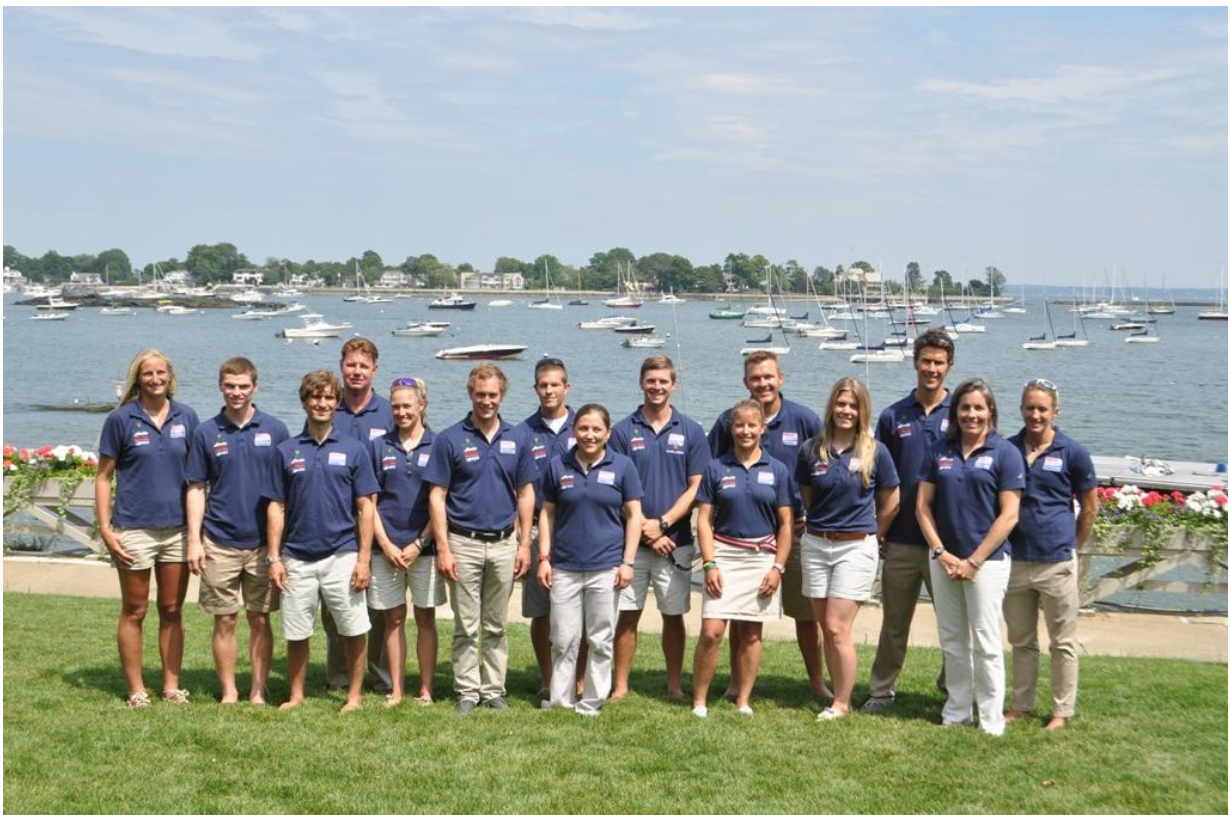
Our Olympic Sailing Team