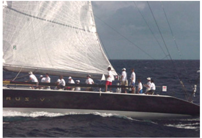
Zephyrus V, first finisher of the 2002 Pacific Cup Race