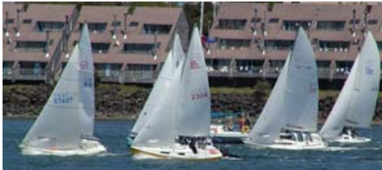
One of the Saturday races