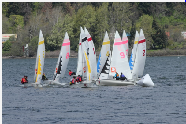
Windward mark rounding at the Hood River Regatta.

We will be hosting a league regatta on Saturday, April 18th in the Yaquina Bay. We expect six to eight visiting teams from the Portland—Hood River area. Sailing times are from 11:00—4:00. The course will be in front of the the Embarcadero with boat exchanges scheduled either at the D Dock or Englund Marine. Come down and watch some very exciting sailing.