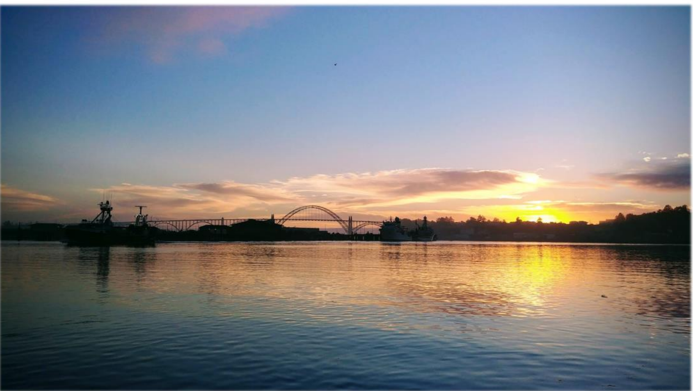
Scenes from the final days of the 2021 Wednesday sailing season, with summer shine fading into autumn glow.