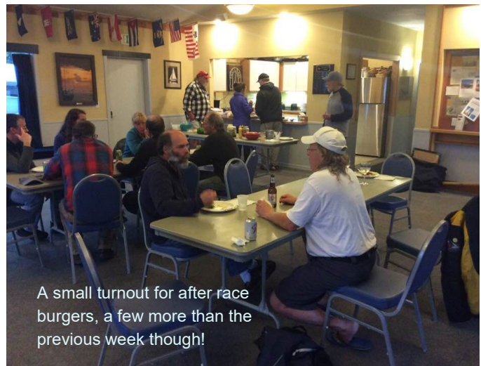
A small turnout for after race burgers, a few more than the previous week though!

The goal here is to try to reestablish the fun of friendly competition and the camaraderie-filled after party at the clubhouse, have old hatchets get buried, hopefully get new people interested in becoming members, or at least create some goodwill towards the club with non-members, and make Wednesdays a high point of everyone's week. The alternative seems to be watching it continue to slowly (or not so slowly) disappear. This is not trying to be dramatic, just stating reality as this writer sees it. .