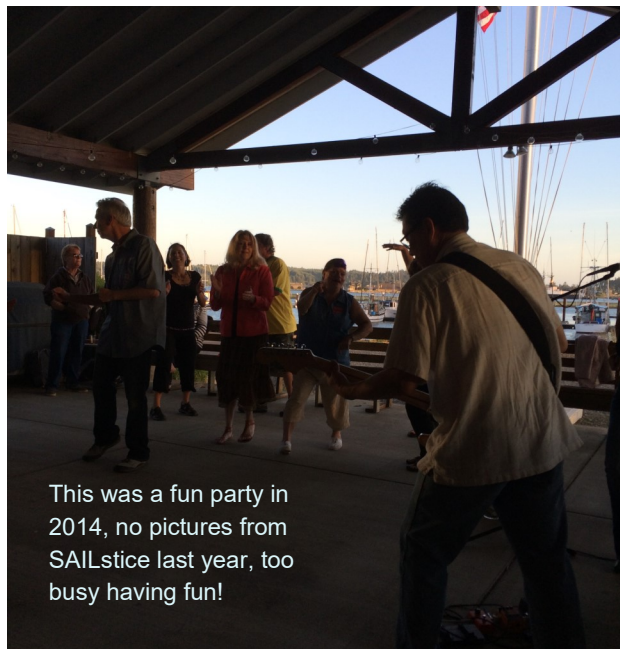
This was a fun party in 2014, no pictures from SAILstice last year, too busy having fun!

We need boats, deckhands, and clubhouse crew for the day, more later.