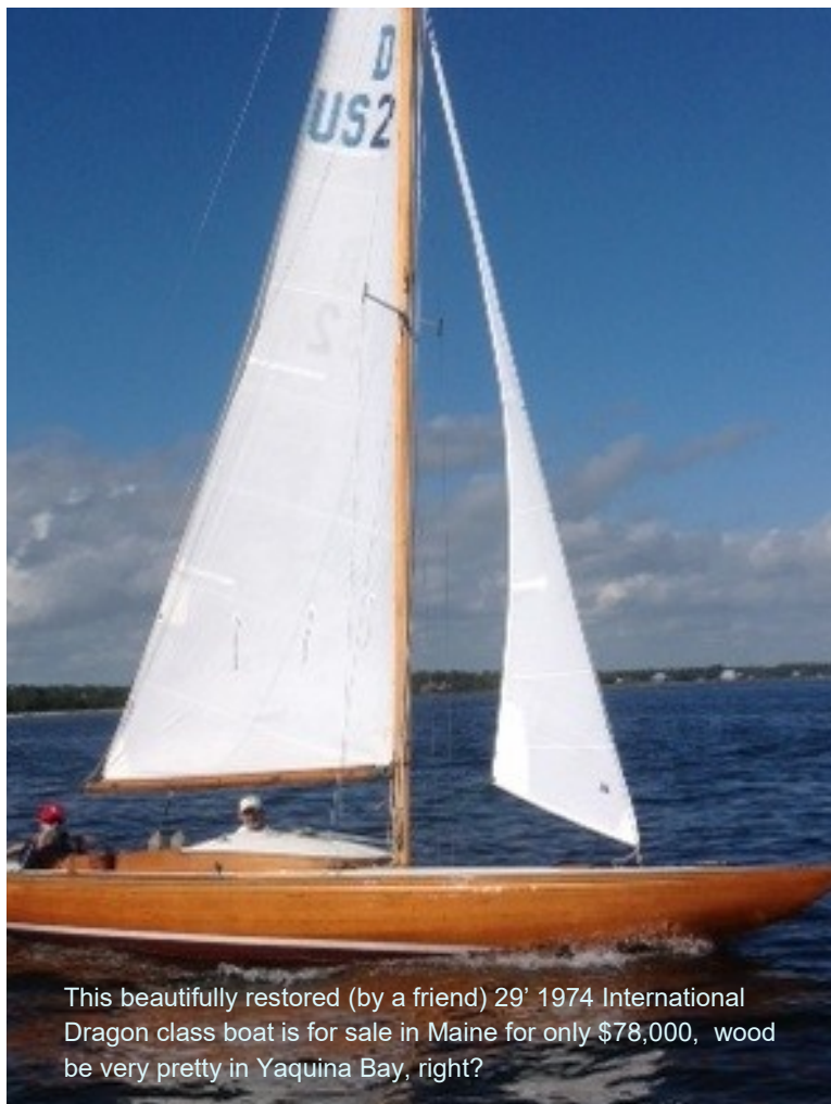
This beautifully restored (by a friend) 29' 1974 International Dragon class boat is for sale in Maine for only $78,000, wood be very pretty in Yaquina Bay, right?

Summer SAILstice is coming fast, more info about that inside as well.