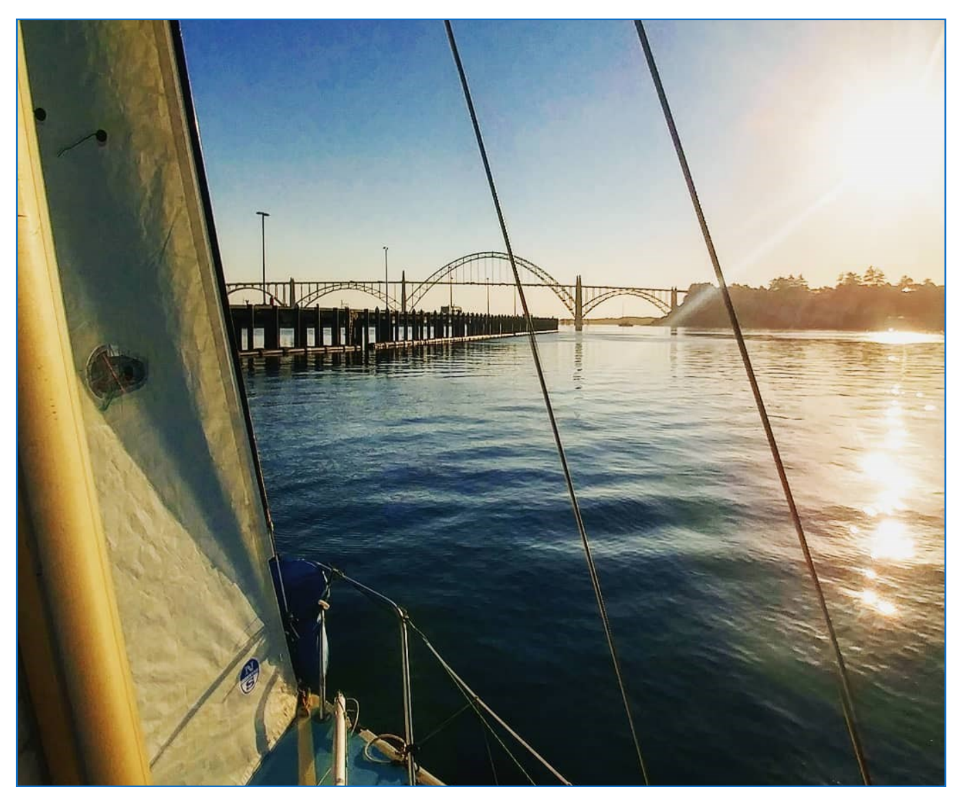
Summertime is here, and Wednesday evenings are best spent on the water....