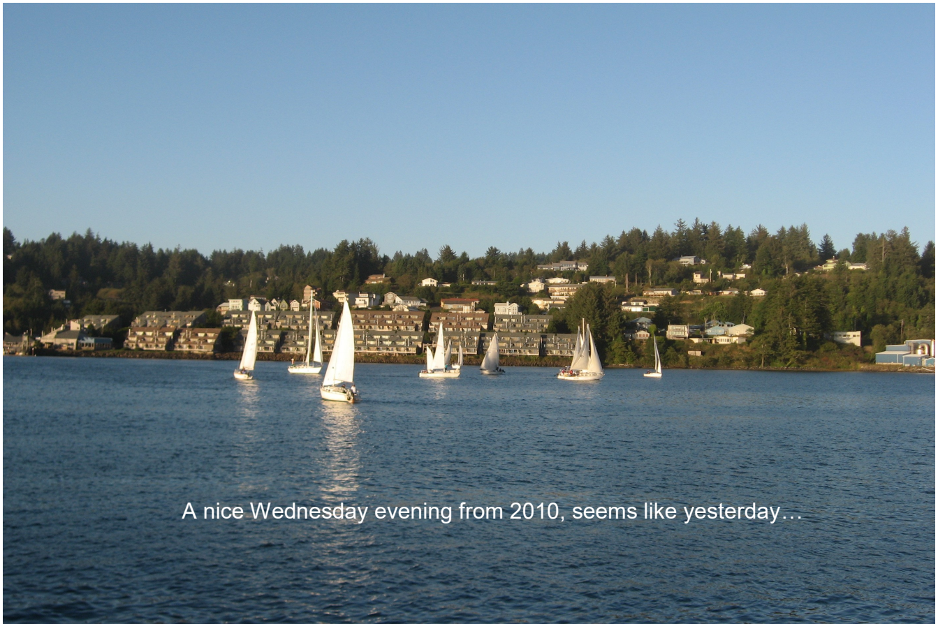
A nice Wednesday evening from 2010, seems like yesterday...