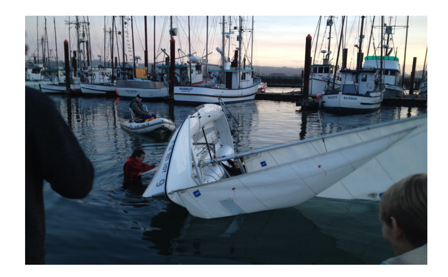
This looks like bath time to me, getting the winter mud off the rails?