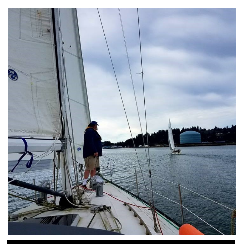
Watching Alchemy sail away on the first Frostbite sail of the eason