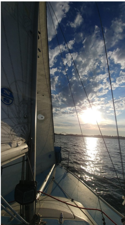
Yaquina Bay reminding us all why this is our favorite way to spend a Wednesday evening.