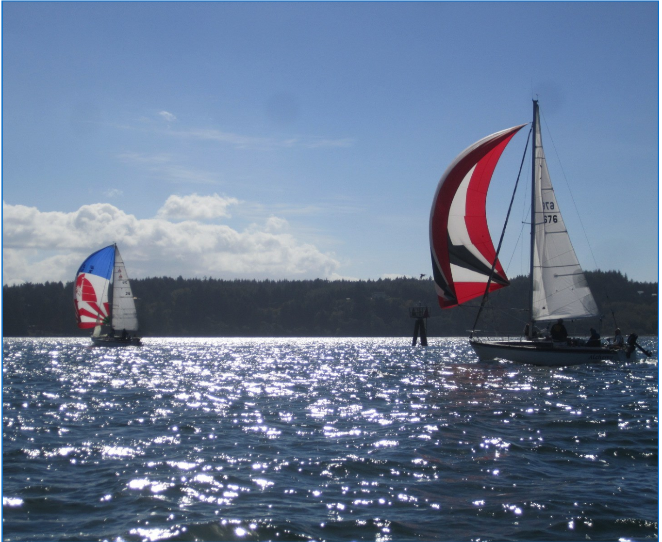
Summertime is here, and Wednesday evenings are best spent on the water....