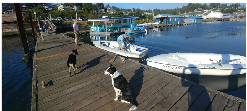
The 420's are ready for the upcoming adult sailing class! YBYC members move the dinghies to the dock while YBYC dogs wag their approval.