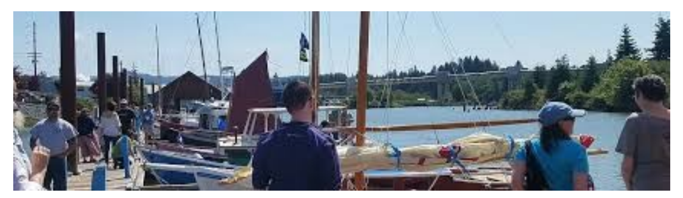
The Toledo Wooden Boat Show is Big Fun! See you there.