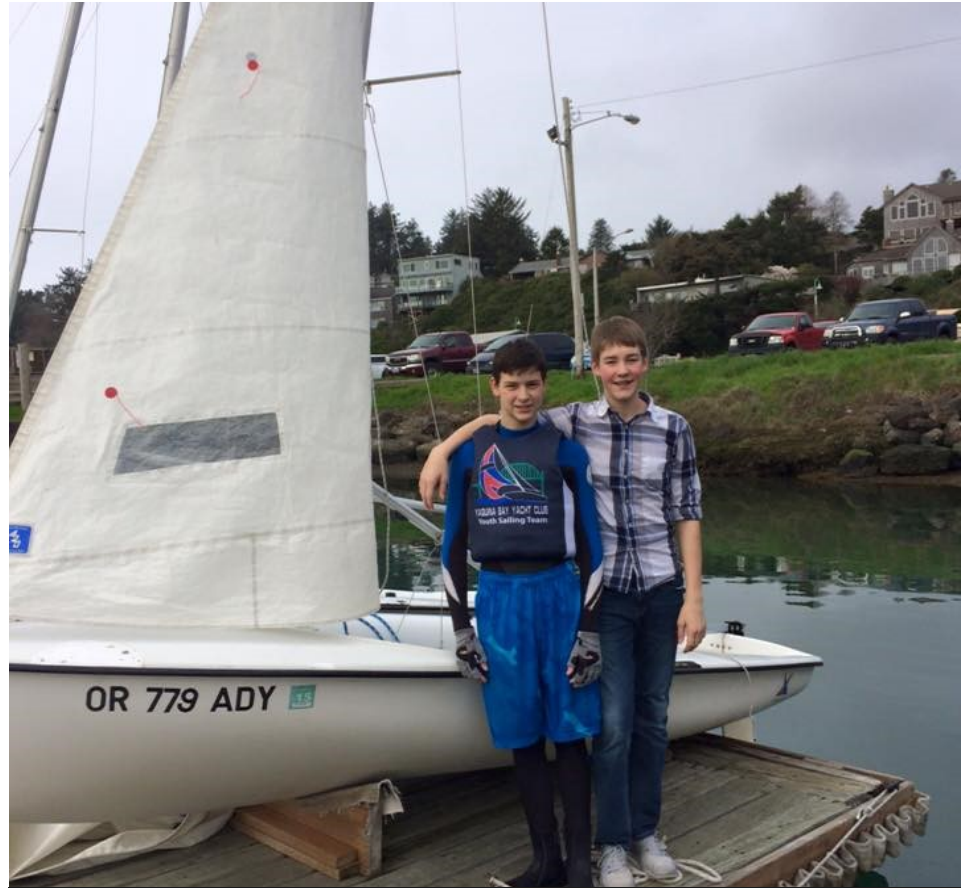
Getting rigged and ready