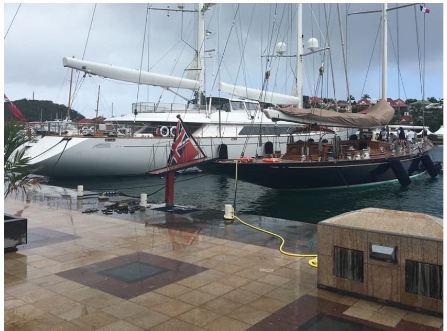
The little black boat is the 143' J Class Topaz, and the big one is Rupert Murdoch's Roseheart. in St. Barths