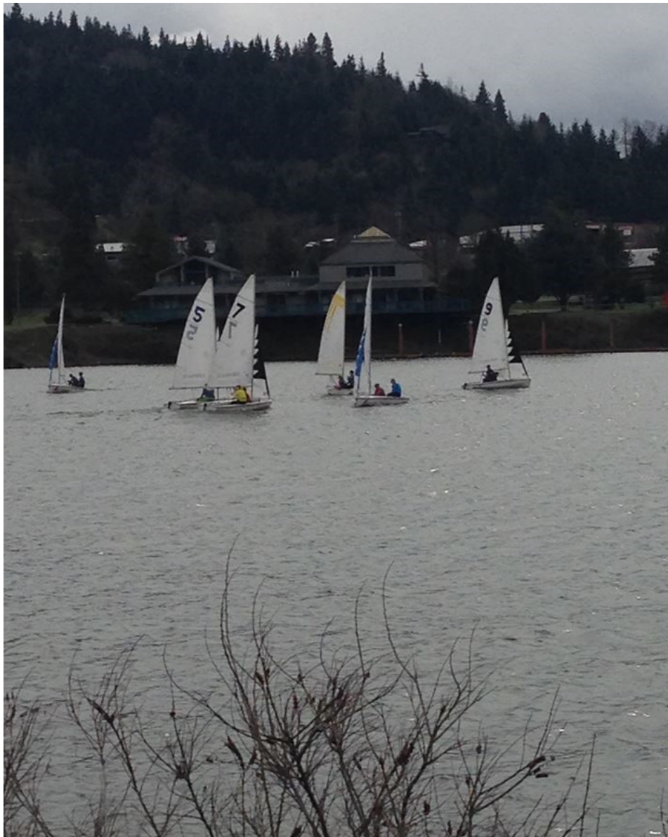
High School Team racing at Hood River March 12