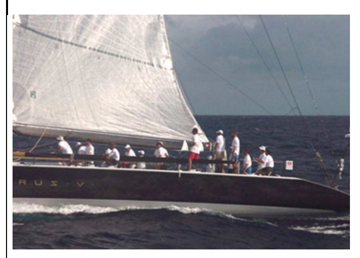
Zephyrus V, first finisher of the 2002 Pacific Cup Race