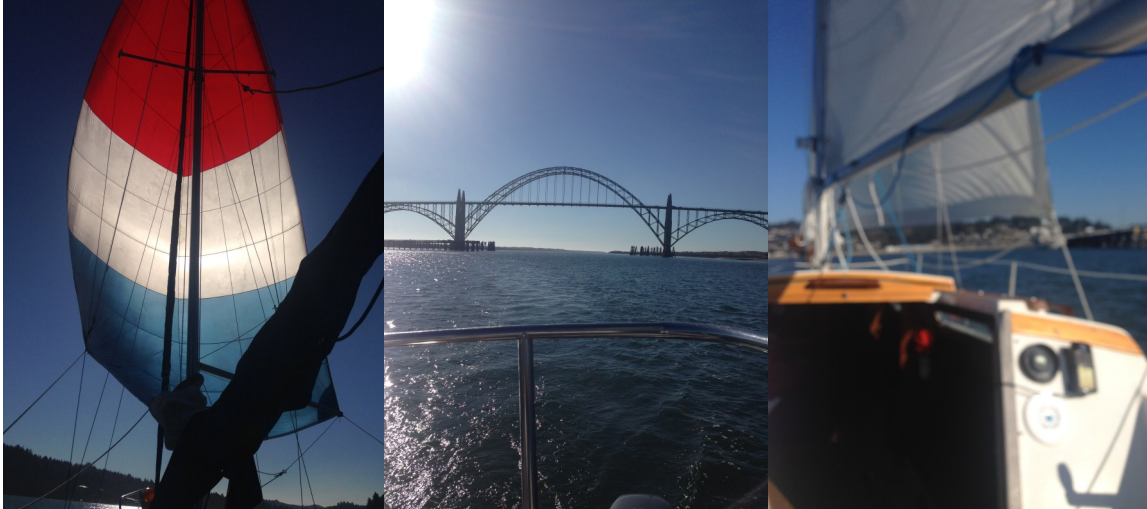
Felicity doing a little frostbiting on January 29th—only there was no frost!