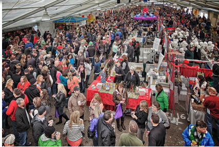
Wine and Seafood Festival