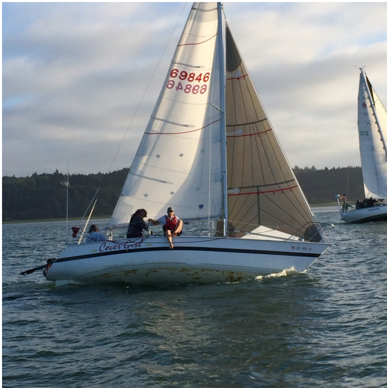
Cover Girl gets a great start