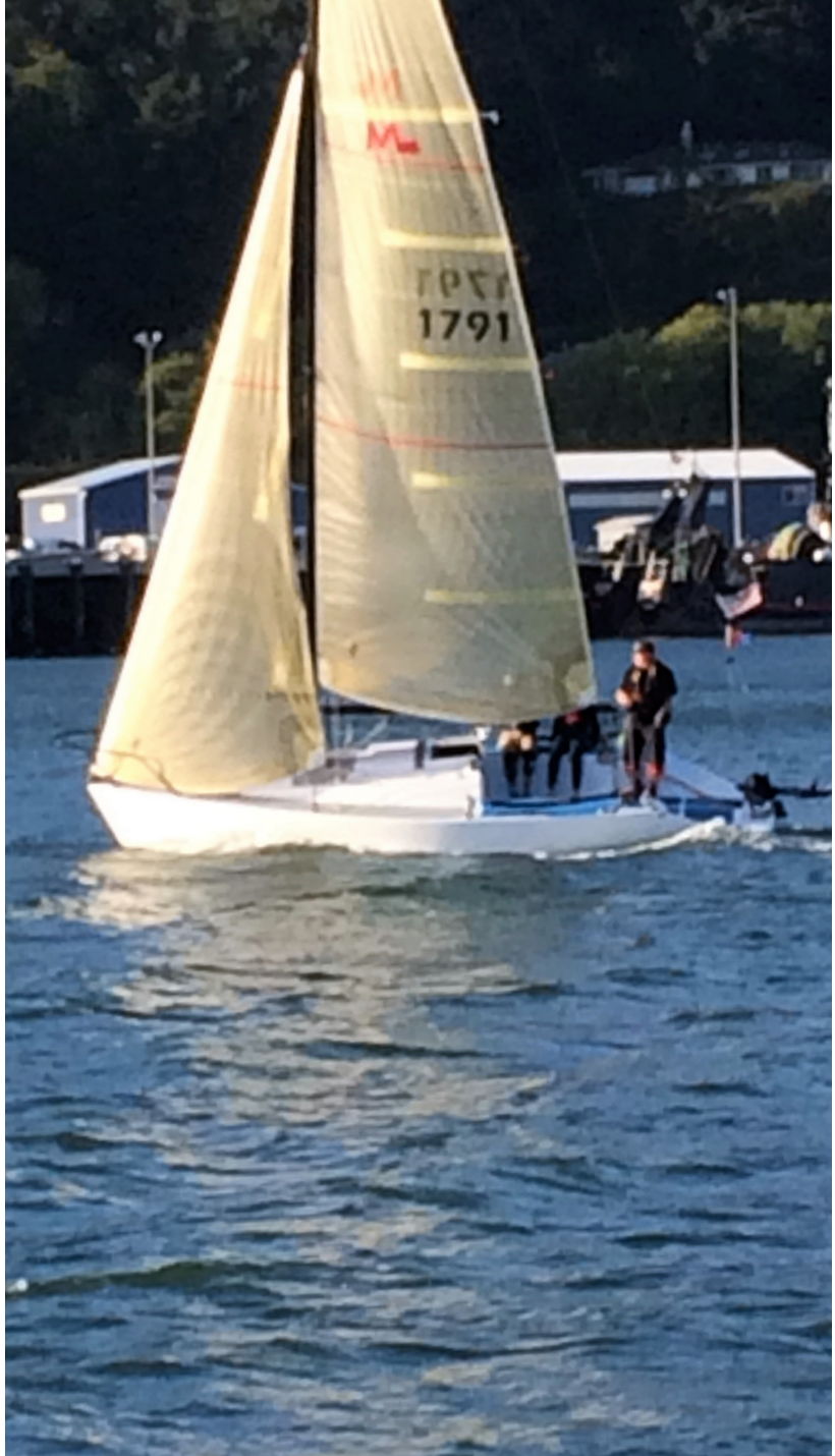
Run Rabbit Run scooting by on a recent Wet Wednesday race.

"There is nothing half so much worth doing as messing about in boats" ~Kenneth Grahame