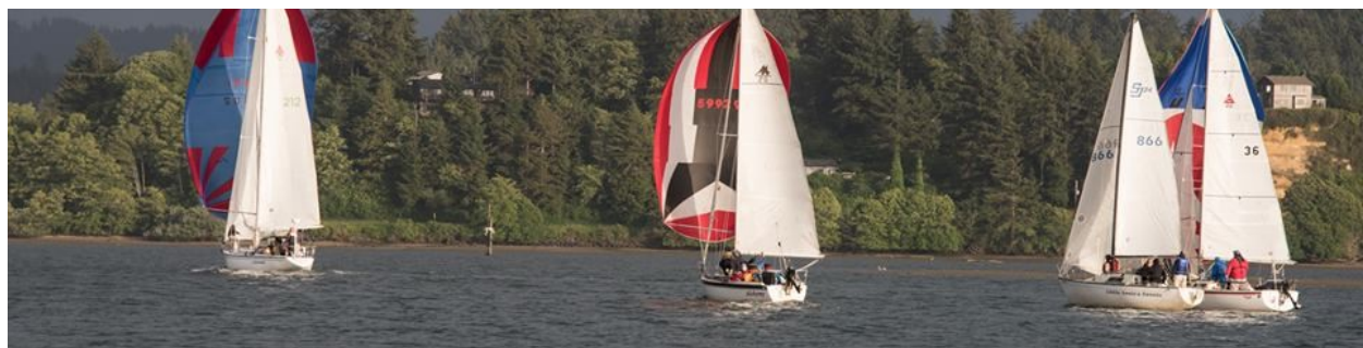
Sails on the Bay

Don't miss the fun on this, the longest weekend sailing day of the year, helping, sailing, or just partying, it's all good!