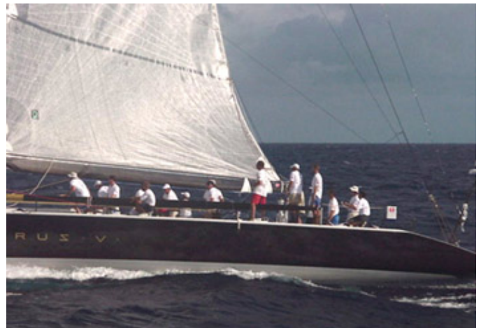
Zephyrus V, first finisher of the 2002 Pacific Cup Race