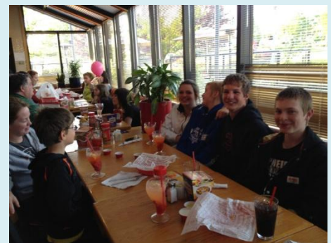
End of Regatta Celebration at Red Robin