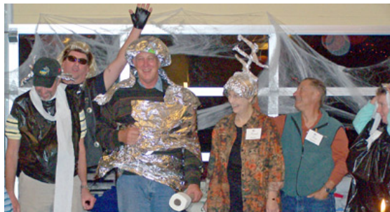
The costume-building contest presentation

Those who did not bring their own costume had "the opportunity" to participate in a costume-building contest using plastic bags, toilet paper, aluminum foil, duct tape and numerous other odds and ends. The tin man and something from outer space emerged from the mess, but the best costume