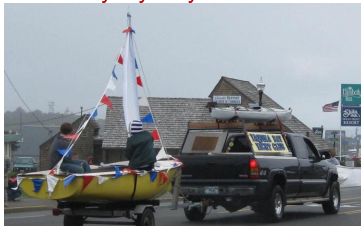
Another picture of our Involvement