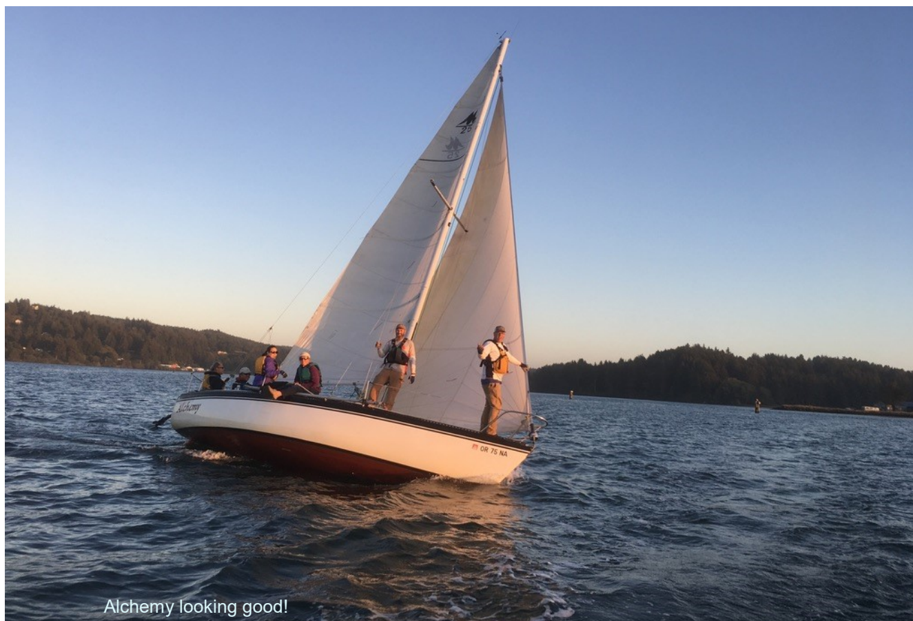
Alchemy looking good!