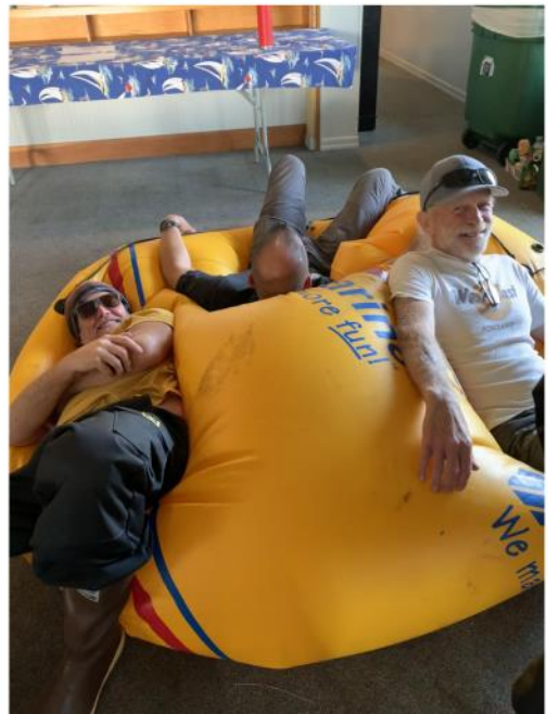
Scenes from a successful Fall Regatta