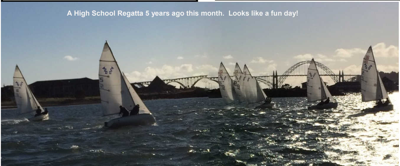
A High School Regatta 5 years ago this month. Looks like a fun day!

Members may always get a copy of the full minutes by e-mailing alimc_77@mcn.com