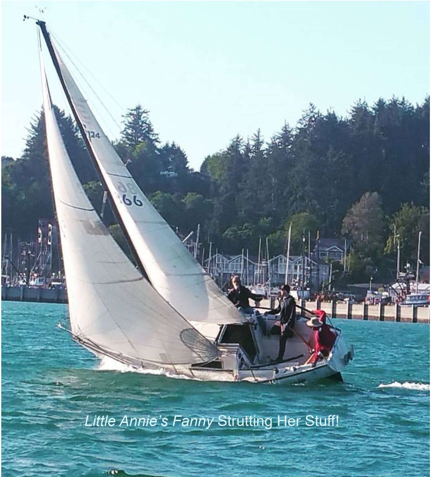
Little Annie's Fanny Strutting Her Stuff!