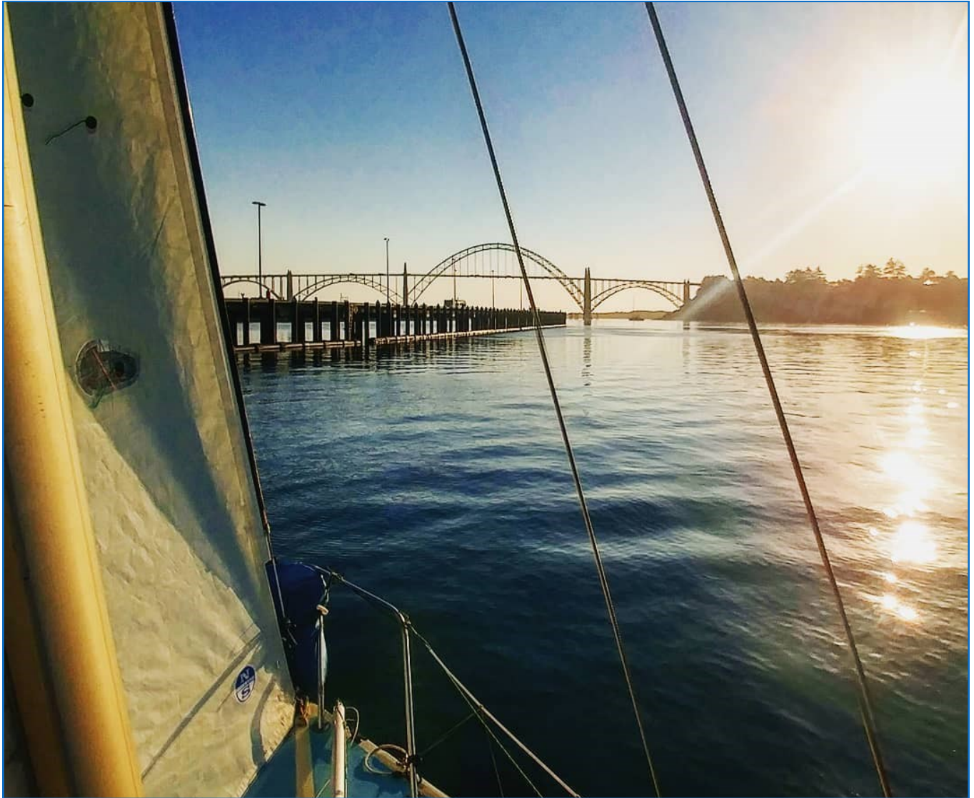
Summertime is here, and Wednesday evenings are best spent on the water....