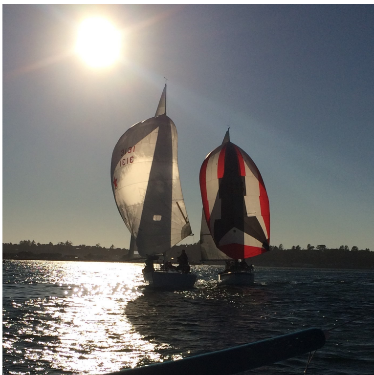
Alchemy and Cheap Sunglasses battling it out near the finish line

This is the time of year when everything seems to happen at once. The Fourth of July is just the beginning, with the Toledo Summer Fest, Wooden Boat Show, Bridge to Bridge Race and much more coming up fast., not to mention the Summer Series Wednesday racing. Hold on tight, here we go!