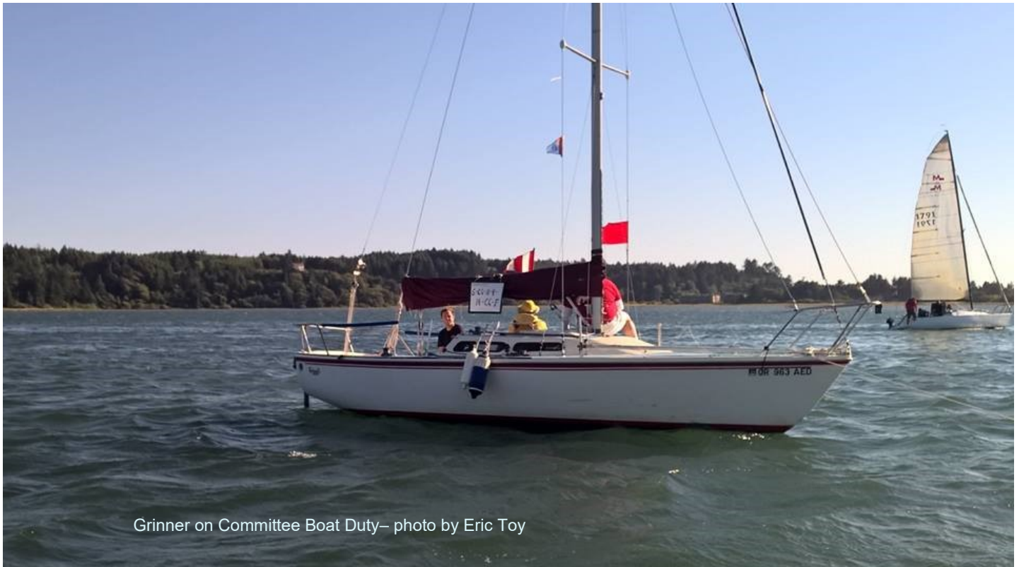
Grinner on Committee Boat Duty