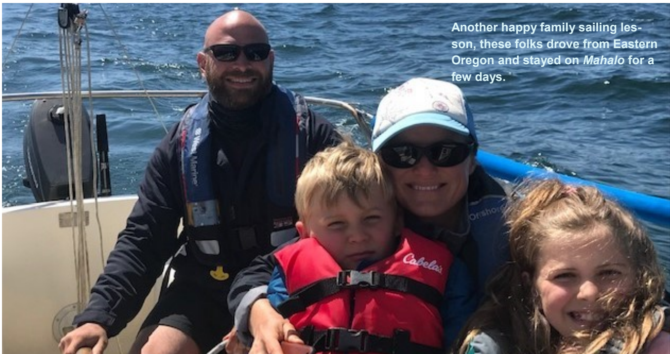
Another happy family sailing lesson, these folks drove from Eastern Oregon and stayed on Mahalo for a few days.