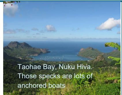
Taohae Bay, Nuku Hiva. Those specks are lots of anchored boats

So we had a slight change of plans, and the crew flew out of Nuku Hiva instead of continuing on to Papeete, where they had to be by the 31 st . They were replaced by Admiral Ladysailor herself, who flew in May 15. It was a happy change for Arabella , because finally we are back to the two of us who know, understand, and love her, and we share the same attitudes about life and cruising. Also the time constraint is removed- no more deadlines to meet or hurrys to be in. I understand some people are bound by their "real life", but this is my real life , and I like to enjoy every minute of it. Now we can relax and experience this beautiful place at a cruiser's pace. Bottom line is, this should have been "plan A".