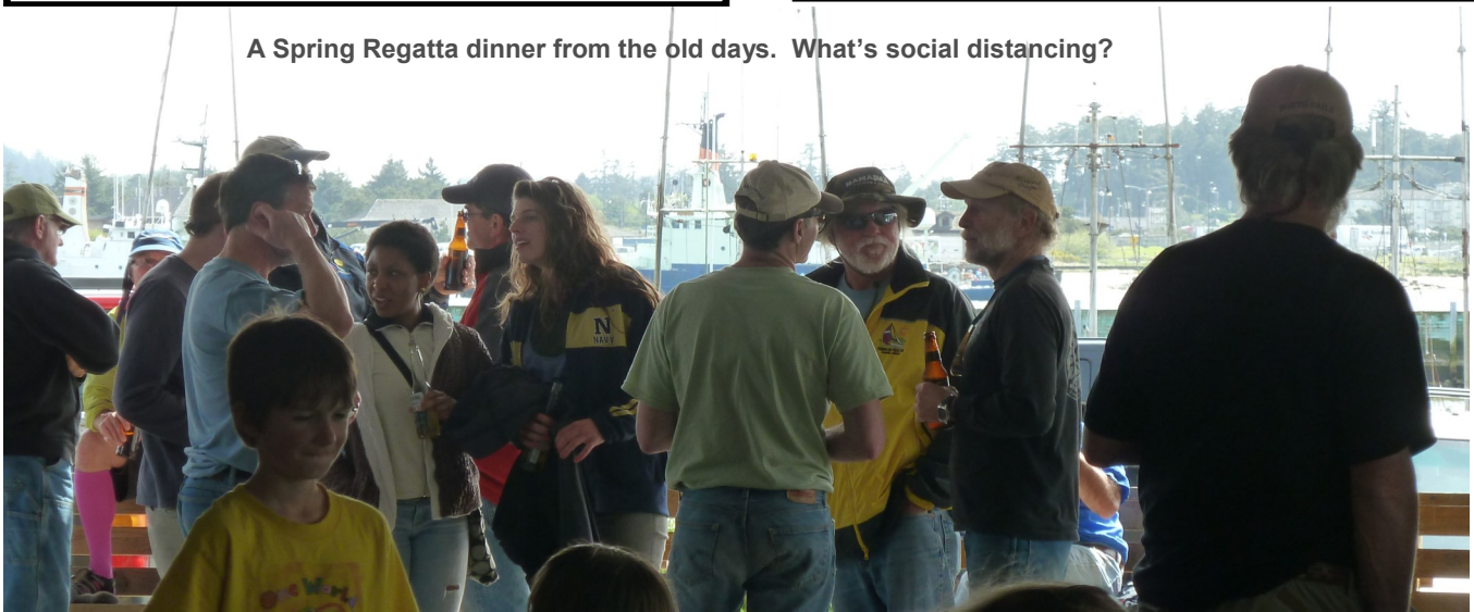
A Spring Regatta dinner from the old days. What's social distancing?

The board meets again on 4/7. Interested members are welcome to attend. Members may always get a copy of the full minutes by e-mailing alimc_77@mcn.com